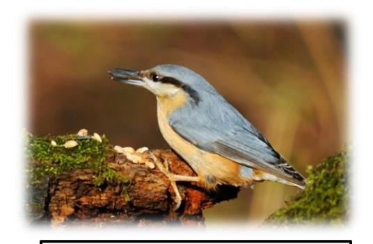
Many nuthatches have been seen on the feeders by the 18<sup>th</sup> green

The Nuthatch is a busy and agile bird often seen working its way down a tree trunk